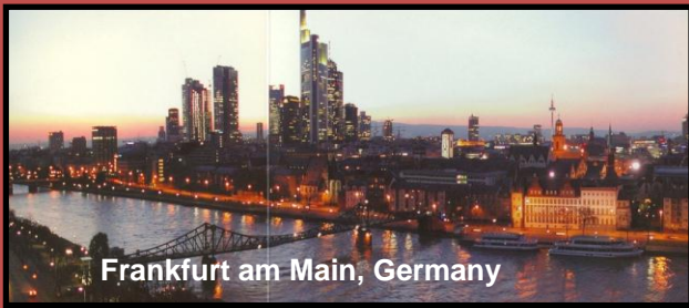
Frankfurt am Main, Germany